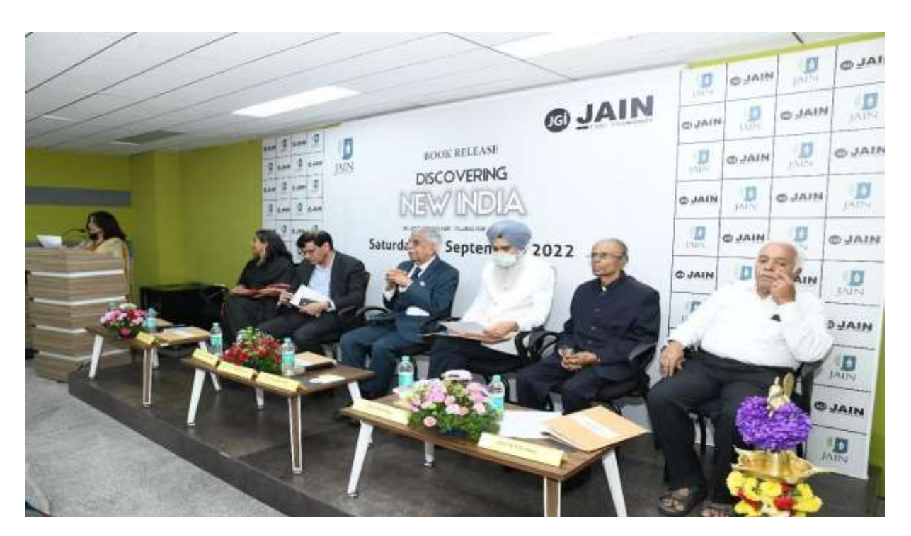
D ignitaries seated during the book release event