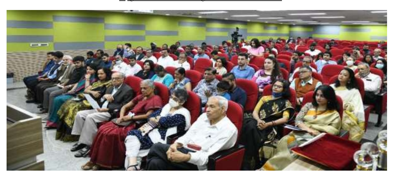
Audience during the book release