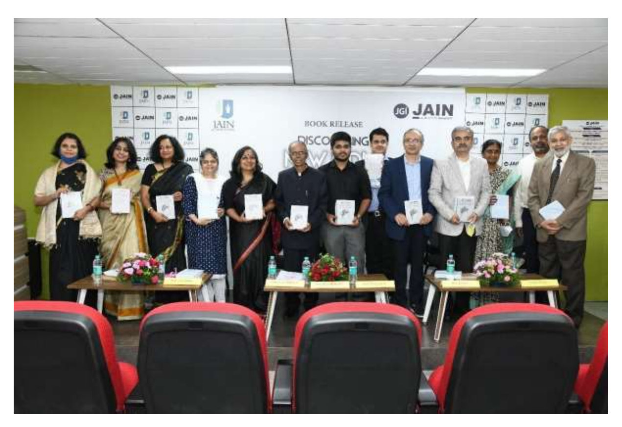
Authors holding the book after the release